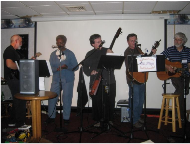
A guitar-intensive NEERSighted entertaining on Thursday night