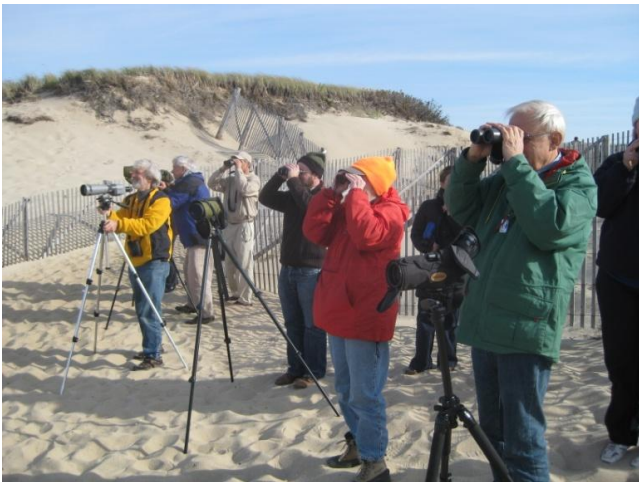
Birdwatchers at Race Point (list of species on pg. 3!)